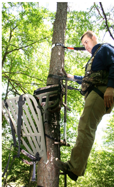
Hang the treestand below the lineman's climbing strap while keeping the strap AND tether/tree strap attached to the tree. Stay doubly attached!